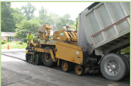
Typical asphalt paving operation

7. Replace roadway lane markings - Permanent lane markings will be replaced shortly after paving operations.