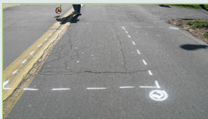
Typical survey paint markings

Overall, the pavement conditions of this road were generally rated as poor to fair. This rating meets the criteria for Primary/Arterial Roadway Preservation using full-depth patching followed by hot mix asphalt (HMA) overlay.