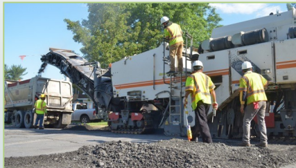
Typical milling operation

placed with new pavement. The final paving of the road will provide a smooth ride.